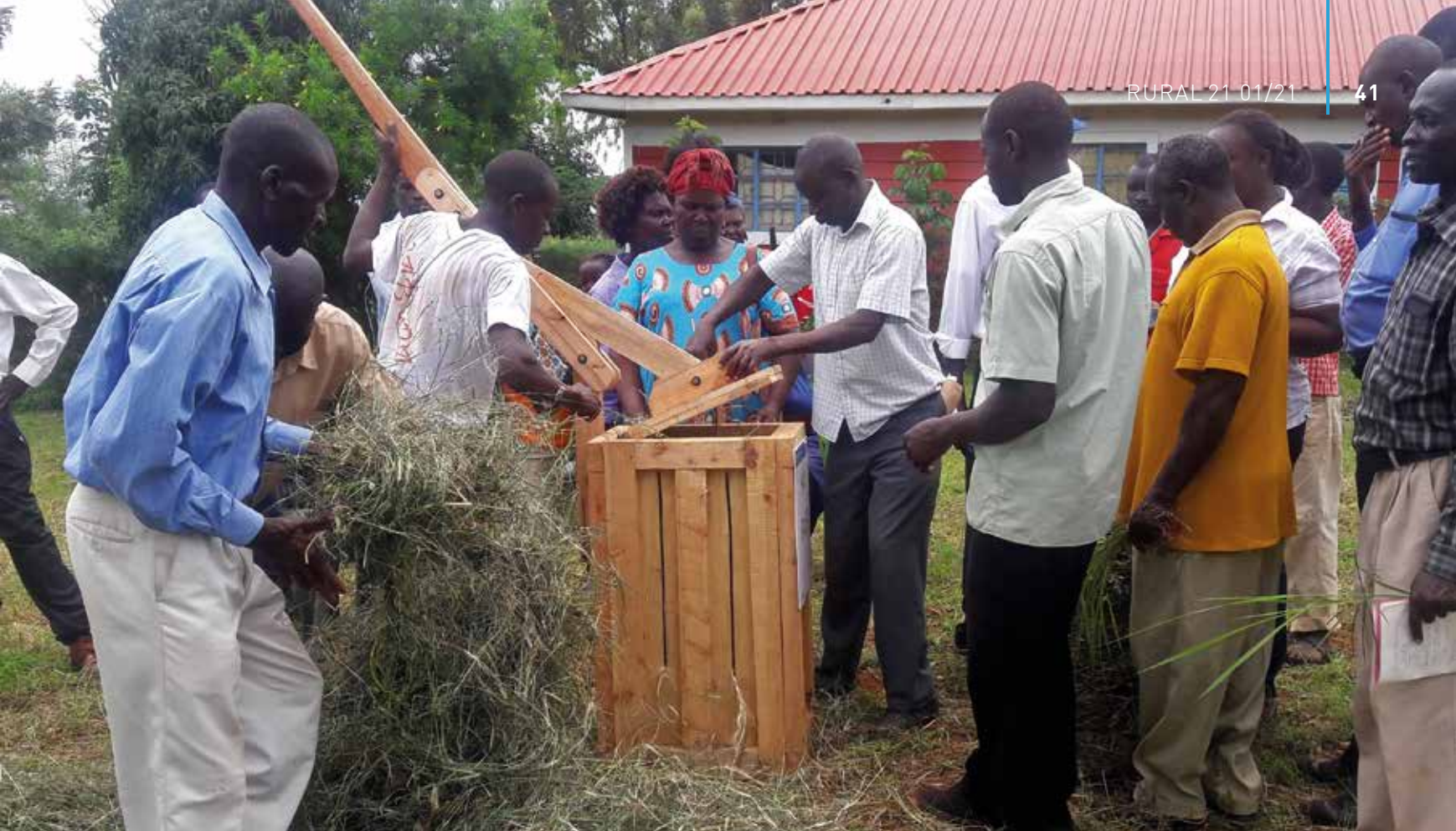
Training participants baling hay using a hay box/ crate.