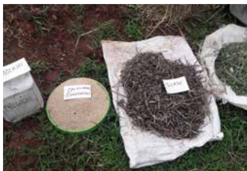
Feed resources for training on preparation of TMR.

Cumulatively, about 95, 80, 63 and 58 per cent of participants realised improvement respectively as a result of training on fodder production, dairy cow feeding, feed formulation and calf rearing (see Figure above). However, more than 35 and 40 per cent of participants respectively did not realise any improvement