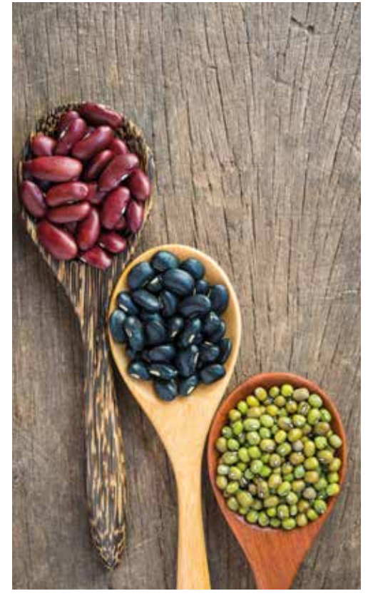
Further research is needed to realise the potential of protein-rich plants such as red beans, black beans and mung beans.

Diversifying the food systems to include these options offers new options for consumers, and new opportunities for farmers to deliver the high value crops and regenerative agriculture we need for the future. It is a necessary solution that works with existing consumer behaviours while reducing greenhouse gas emissions and freeing up land for nature restoration and more sustainable farming practices. Peer-reviewed studies show that shifting to plant-based and cultivated meat could reduce climate emissions by up to 94 per cent compared with farming animals - enabling people to eat their favourite foods without accelerating the climate crisis. Also, plantbased and cultivated meat could deliver the meat people want with up to 90 per cent less land (see Figure on page 38).