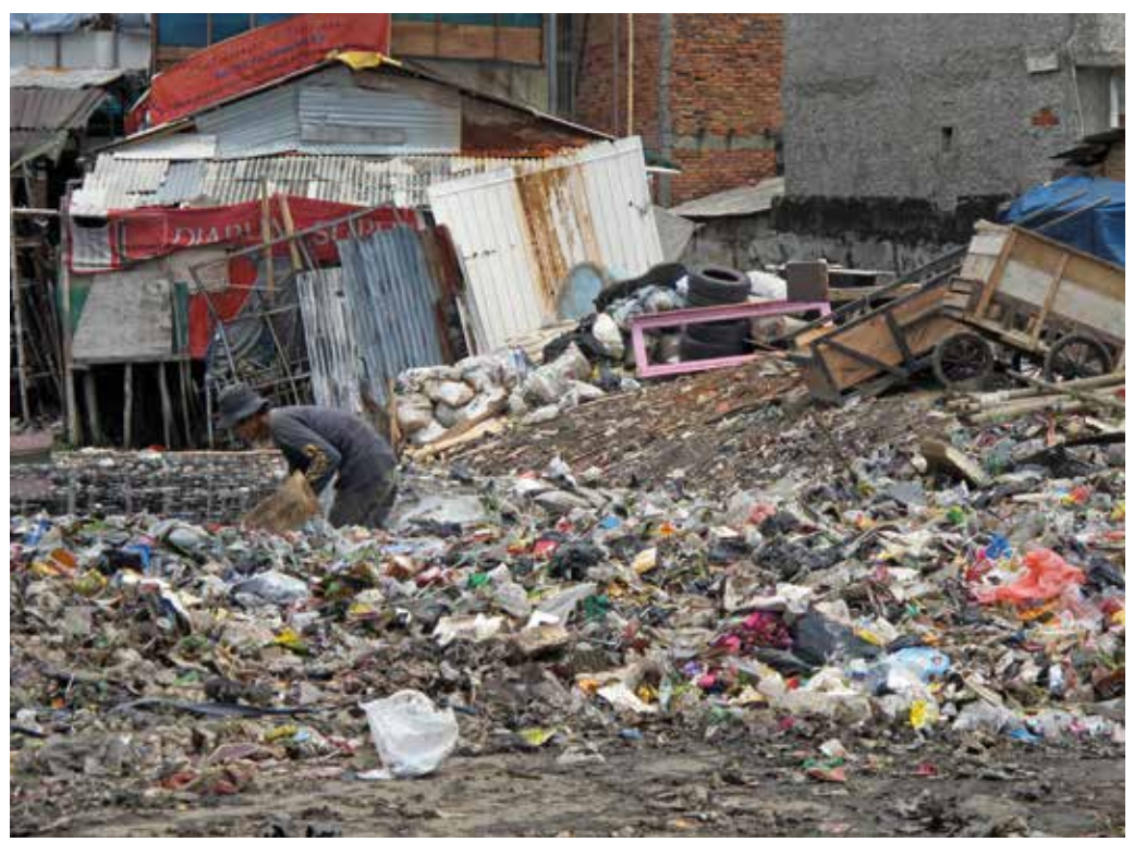
A scavenger in a low-income neighbourhood in Jakarta, Indonesia. More than two thirds of the plastic wastes generated in the world are short-lived plastics consisting mainly of municipal solid wastes.